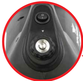
Droplet Size / Flow Rate Adjustment