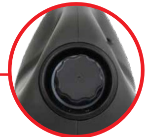
Easy Fill Reservoir