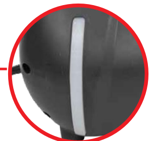
Reservoir Level Window to Monitor Liquid Levels