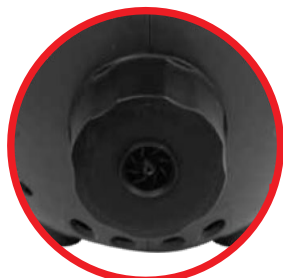
2 Flow Rate Nozzles included in F-8 Models