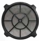
NFR12 Outer Nylon Mesh Filter