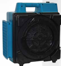
X-2380 NFR9 - Outer Nylon Mesh Filter NFS13 - Nylon Mesh Filter WF50 - 2" Thick Washable Filter