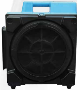
X-3300 NFS16 - Nylon Mesh Filter PF16 - Pleated Media Filter WF35 - Washable Purifying Filter WF35 + EVA - Washable Purifying Filter