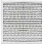
PF16 Pleated Media Filter