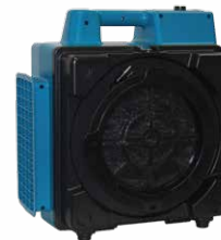
X-2580 NFS13 - Outer Nylon Mesh Filter NFS13 - Nylon Mesh Filter CF35-33 - 1.4" Activated Carbon Filter HEPA35-33 - HEPA 1.4" Filter