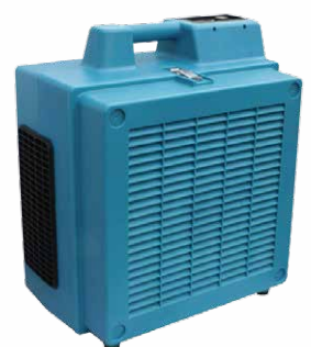
X-3700 NFS16 - Nylon Mesh Filter PF16 - Pleated Media Filter CF35 - 1.4" Activated Carbon Filter HEPA50 - HEPA 2" Filter