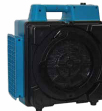
X-2580 NFS13 - Outer Nylon Mesh Filter NFS13 - Nylon Mesh Filter CF35-33 - 1.4" Activated Carbon Filter HEPA35-33 - HEPA 1.4" Filter