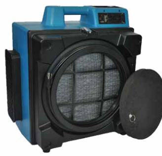
X-3400A NFS16 - Nylon Mesh Filter PF16 - Pleated Media Filter HEPA50 - HEPA 2" Filter