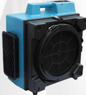
X-3500 NFS12 - Outer Nylon Mesh Filter NFS16 - Nylon Mesh Filter CF35 - 1.4" Activated Carbon Filter HEPA50 - HEPA 1.4" Filter