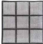
NFS16 Nylon Mesh Filter