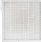
HEPA35 HEPA 1.4" Thick Filter