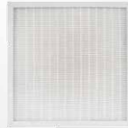
HEPA50 HEPA 2" Thick Filter