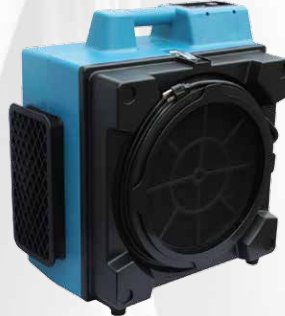
X-3500 NFS12 - Outer Nylon Mesh Filter NFS16 - Nylon Mesh Filter CF35 - 1.4" Activated Carbon Filter HEPA50 - HEPA 1.4" Filter