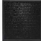
CF35 1.4" Activated Carbon Filter