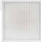
HEPA35 HEPA 1.4" Thick Filter