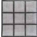
NFS16 Nylon Mesh Filter