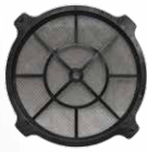
NFR12 Outer Nylon Mesh Filter