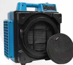
X-2480A NFS13 - Nylon Mesh Filter PF13 - Pleated Media Filter HEPA35-33 - HEPA 1.4" Filter